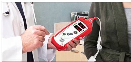
Portable and durable handheld device