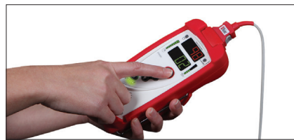
Intuitive user interface